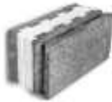
TUFF BLOCKS | Insulated Recycled Concrete