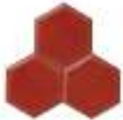
TUFF PAVERS | TRIHEX