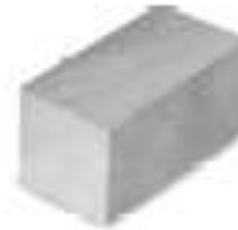
TUFF BLOCKS | Flyash Recycled Concrete