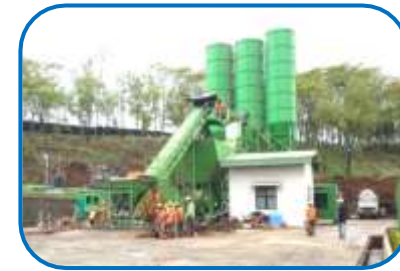
Construction Material (CM)