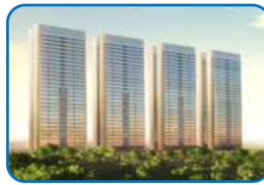
Real Estate : Property Development (RE : PD)