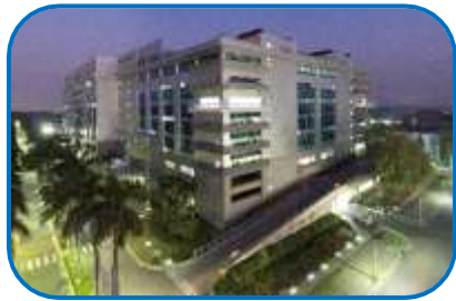
Real Estate : Estate Leasing (RE : EL)