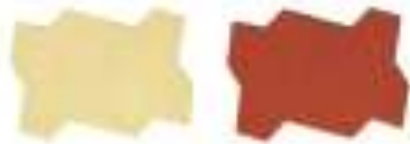
TUFF PAVERS | ZIGZAG