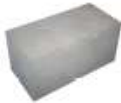
TUFF BLOCKS | Solid Recycled Concrete