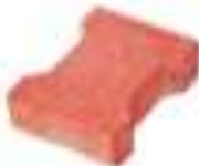
TUFF PAVERS | I SECTION