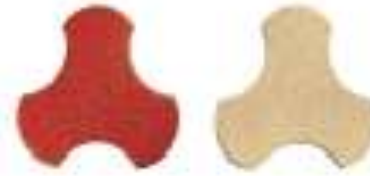
TUFF PAVERS | COLORADO