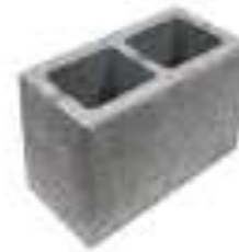
TUFF BLOCKS | Hollow Recycled Concrete