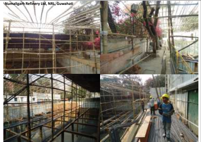
Numaligarh Refinery Ltd, NRL, Guwahati

www.greentree-india.com Smart Metering | Engineering | Green Building | MEP Services | Energy Modeling | Commissioning | CFD | Energy Audit | Advisory