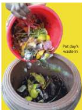
Put day's waste in