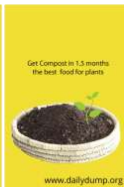
Get Compost in 1.5 months the best food for plants